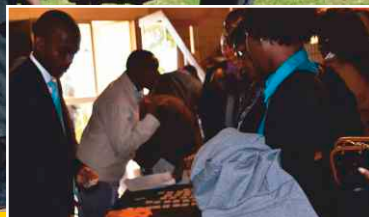
Well Organised REGISTRATION Process