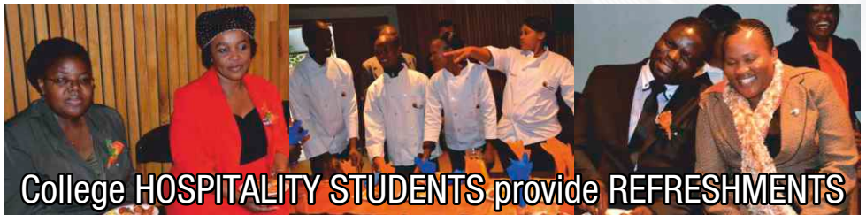
College HOSPITALITY STUDENTS provide REFRESHMENTS

Lastly, to our beloved graduates, thank you for persevering to the end. Now you will reap the reward of your hard work. Congratulations and well done.