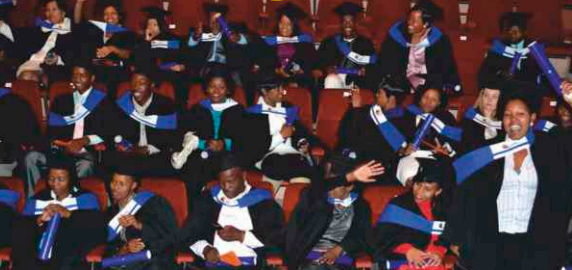
Graduates Celebrate by dancing to the music.