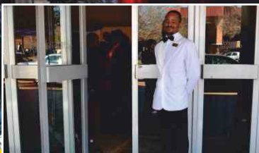
THEY ARE WARMLY WELCOMED BY SRC