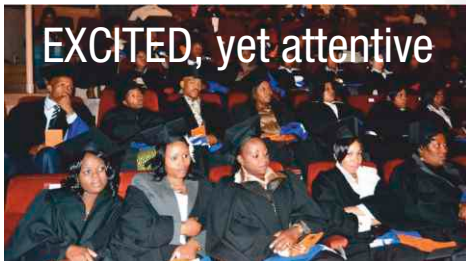
Some of the 202 graduates seated and listening attentively to various speakers .

Ninety four (94) will graduate in Management Assistant, 1 in Educare, 2 in Marketing Management, 9 in financial management, 57 in Business Management and 39 in Engineering.